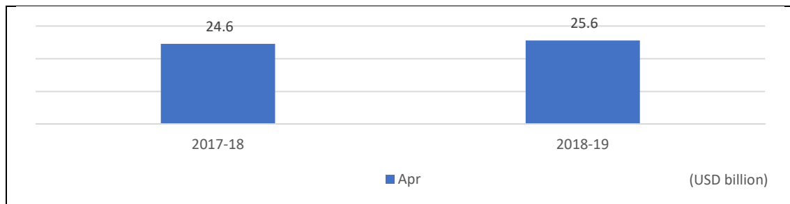
Exhibit 1: Trend in overall exports by India

India reported merchandise exports of USD 25.64 billion in April 2018, up 4.2% from USD 24.60 billion in April 2017.