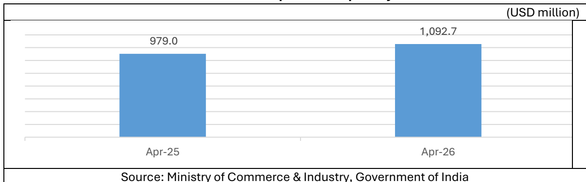
Exhibit 2: Trend in plastics export by India

India's plastics and allied product exports posted 7.9% growth to USD 1056.5 million in April 2026 from USD 979.0 million in the year ago month led by rise in shipment of raw materials, films & sheets, Human Hair, Packaging items and so on.