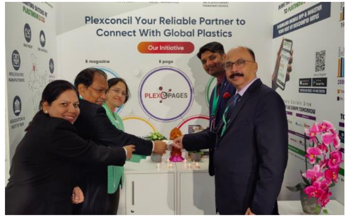
PLEXCONCIL representatives and the Indian exhibitors usher the auspicious festival of Diwali at K 2022, Germany by holding a Pooja ceremony in the India Pavilion

The Council representatives met with all the 147 Indian exhibitors participating at K 2022 to greet them on the festive occasion of Diwali and sought feedback on their participation experience at the trade fair. The delegates were also briefed on the various export promotion initiatives undertaken by the Council and the Government of India schemes that enables MSMEs to boost their exports. The Council extended all its support and assistance to the Indian delegates at the trade fair and assured the same in all their future endeavours.