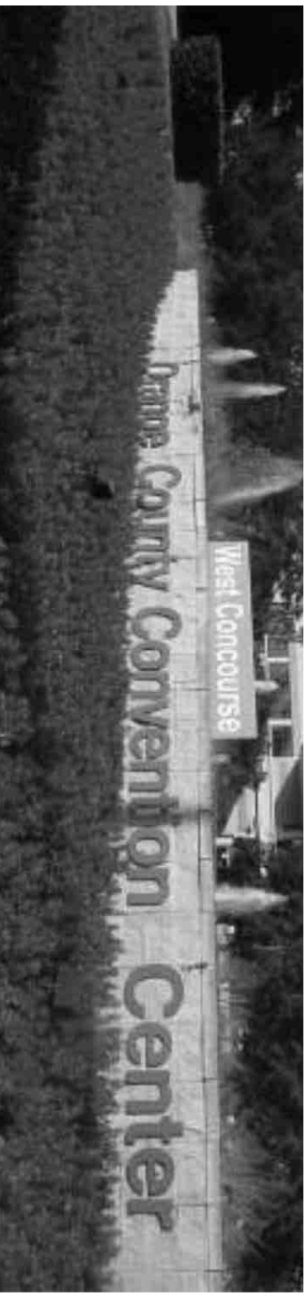
Exhibit at NPE2015: Reach key buyers.